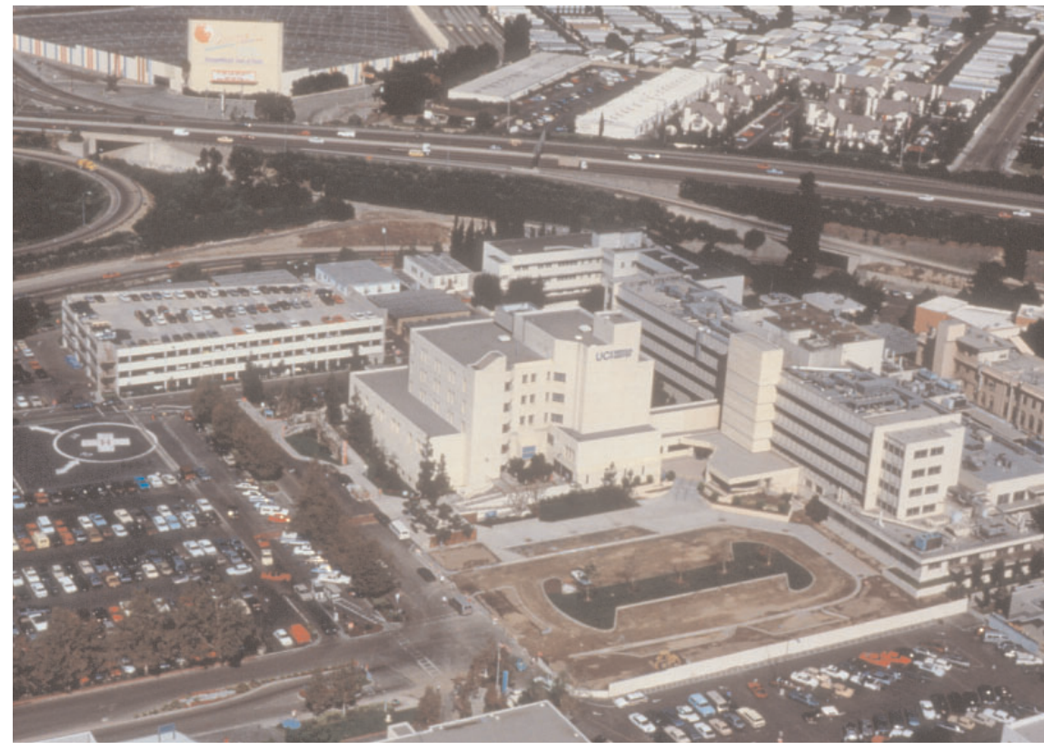
Figure 5: UCIMC Aerial Photo (Circa 1982)

L.A. Pesch and Associates performed a planning study in 1981 to address issues such as traffic, circulation, material movement, and phasing. This study proposed to develop a modular building system at the center of the site that would provide incremental development along well-defined circulation spines. This would tie together the zones established by the Redevelopment Master Plan. The Diagnostic Services Center (DSC), Medical Library, and Magnetic Resonance Imaging (MRI) building were built on this concept. This plan, however, was not formally adopted.