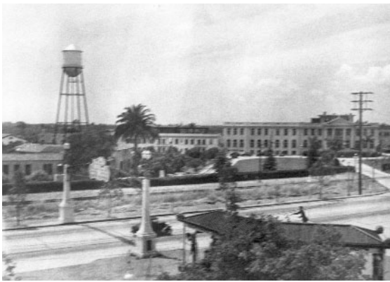
Historical Photo (View across Interstate 5)