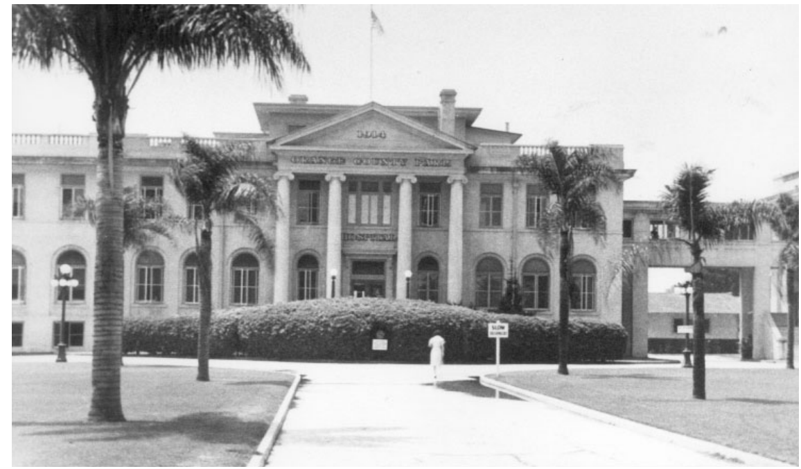
Historical Photo (View of Hospital)