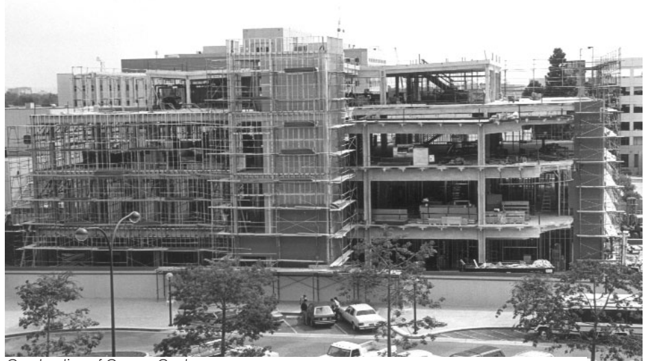
Construction of Cancer Center