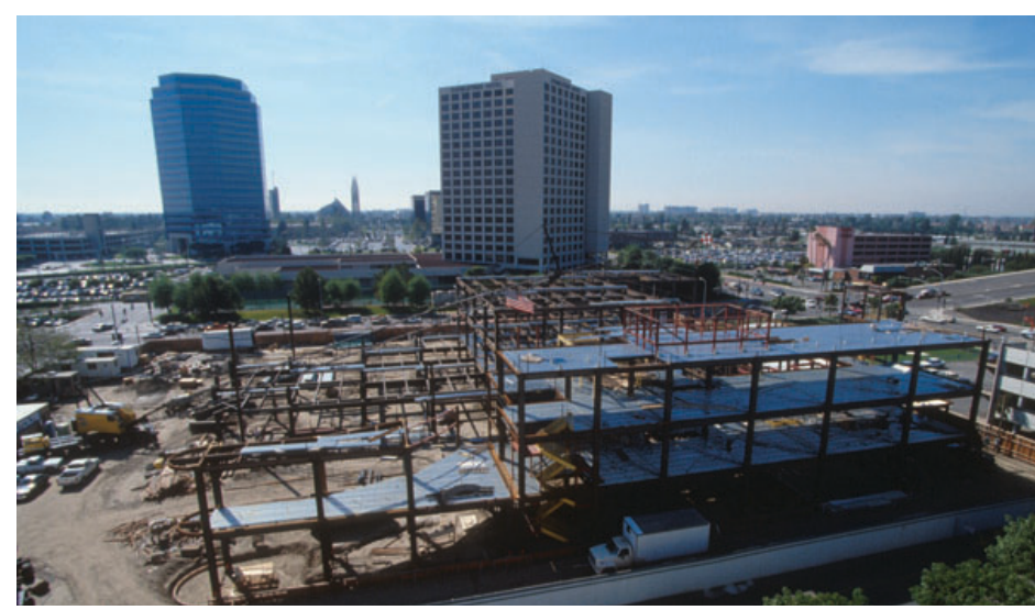
Construction of UCI Neuropsychiatric Center

Refer to Section 3 for future concepts and goals of the Long Range Development Plan.