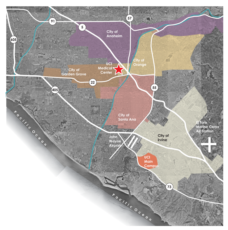
Figure 2: Vicinity Map