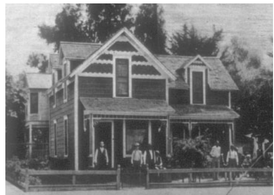
The Orange County Hospital

For the past 25 years, UCIMC has provided invaluable service for the community. Because of its history as a county facility, UCIMC has been the hospital of last resort for the uninsured population, providing more indigent care than any other area hospital. UCIMC has also played an integral role in the development of the CalOptima model, an entity created to move Medi-Cal beneficiaries from fee-forservice Medi-Cal into managed care. Even with the financial issues associated with prevailing patient care for the indigent population, UCIMC has continually provided outstanding service in primary care, specialty care, and diagnosis and treatment of complex medical conditions and injuries.