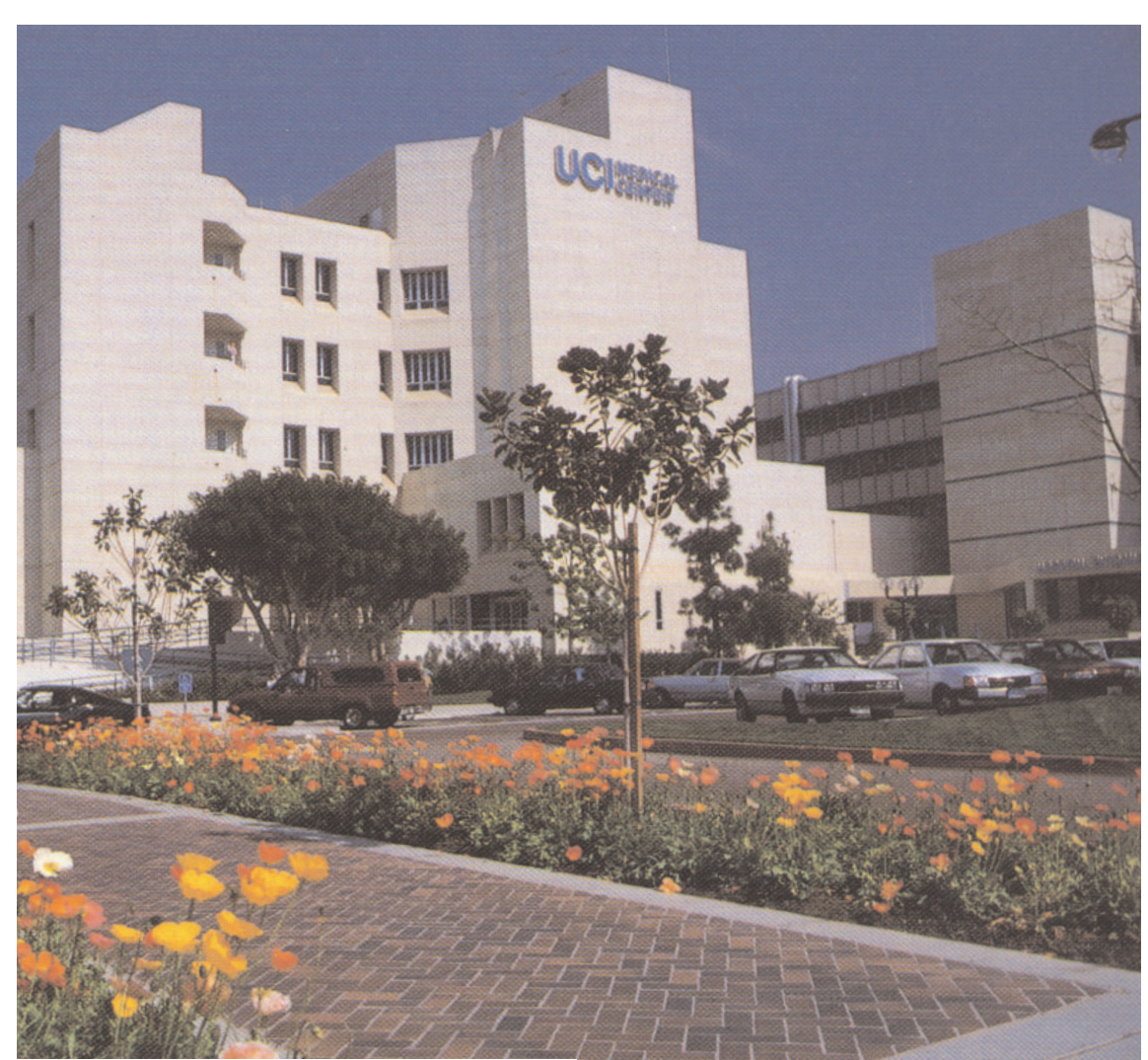
UCI Medical Center

A program Environmental Impact Report (EIR) has been prepared, in conformance with the California Environmental Quality Act (CEQA), to analyze the effect of the LRDP on traffic, parking, air, water, drainage, soil, etc.