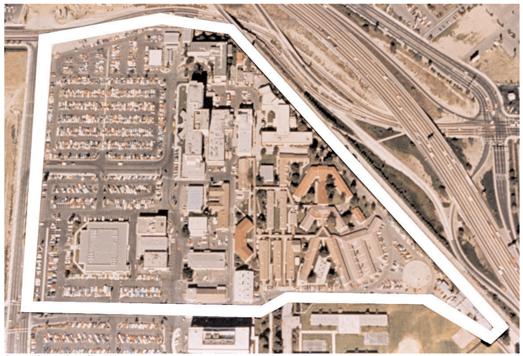
Figure 3: UCI Medical Center (Circa 1976)