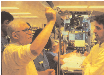
Louis Gluck, one of the fathers of modern neonatal medicine.